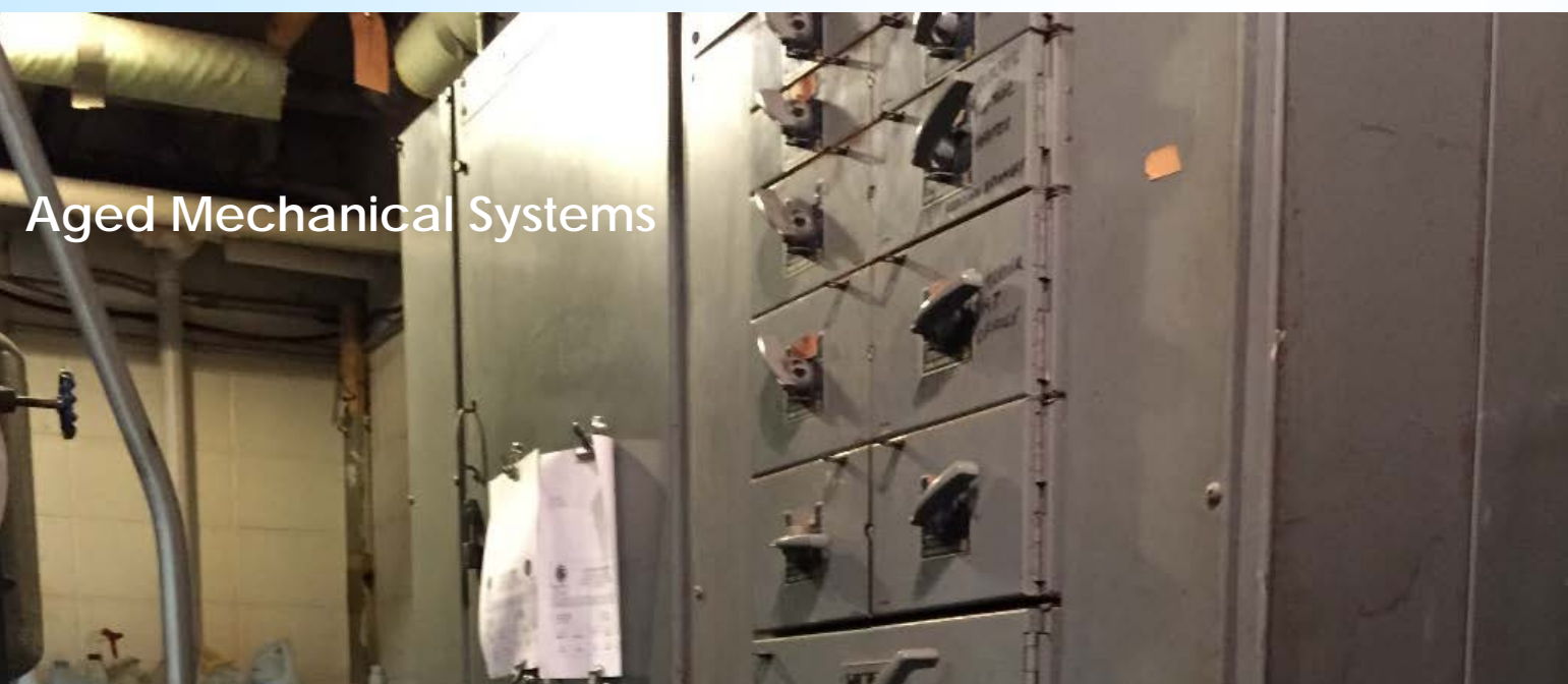
Aged Mechanical Systems