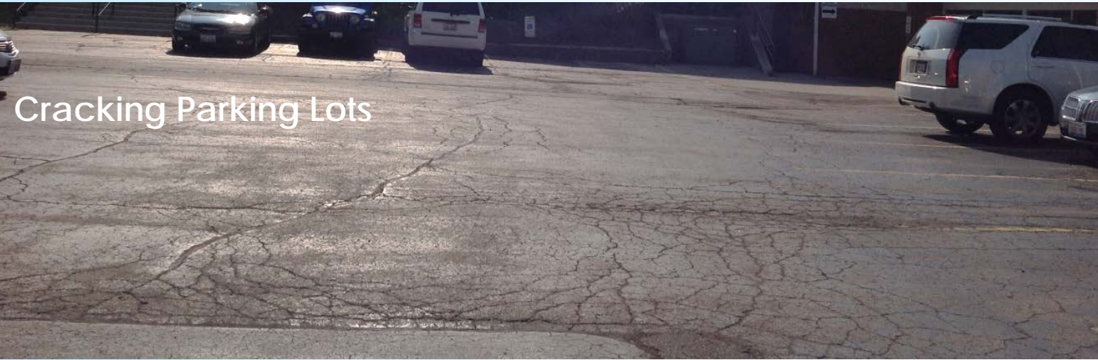
Cracking Parking Lots