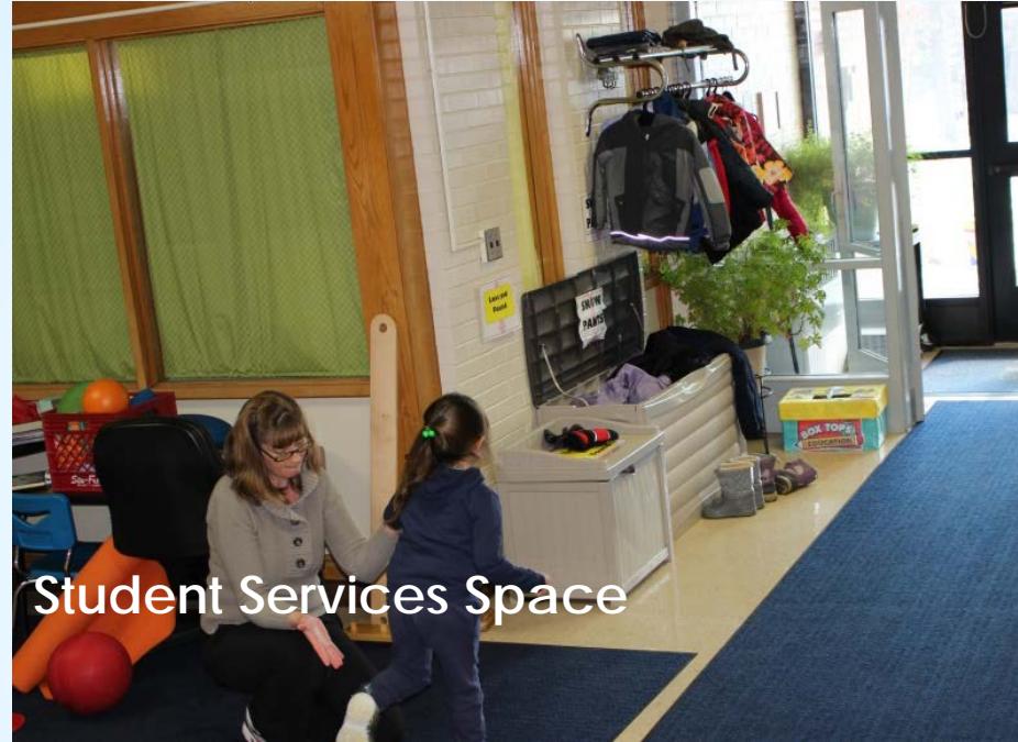
Student Services Space